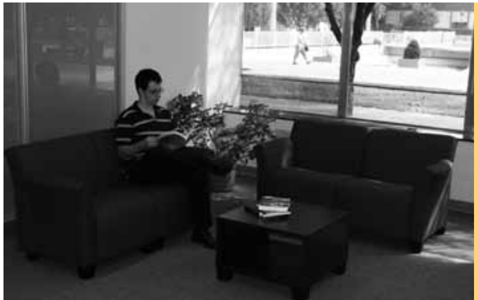
TRC Faculty Lounge