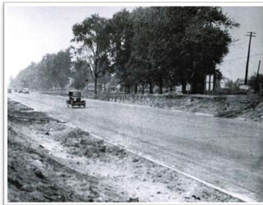
Woodward in Ferndale, ca 1920 (road surface was oiled gravel)