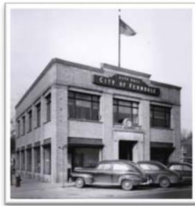
City Offices and Courthouse mid 1930s - 1970 Woodward and Bennett Museum Archives

Architectural rendering, Museum Archives