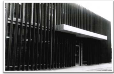
43rd District Court 1971 - Present 305 East Nine Mile Ferndale Gazette