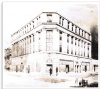
Ferndale Courthouse ca 1931 - mid 1930s Harrison Bldg. (top floor) Woodward and Nine Mile

Architectural rendering, Museum Archives