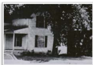
First "Courthouse" (farmhouse room) mid-1920s East Nine Mile & Bermuda Museum Archives