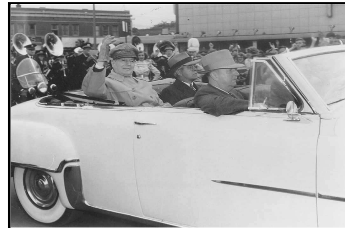
General Douglas MacArthur visits Ferndale.