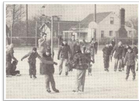
The "Magic Squares" were 120' x 120' fenced, hard surface areas. Ten activities were conducted on them, providing year-round use for recreational activities. The picture on the right shows a "Magic Square" flooded for ice skating.