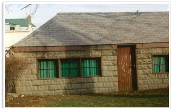
Lovell Turnbull garage, 270 W. Saratoga, where Village's first fire-fighting equipment was stored