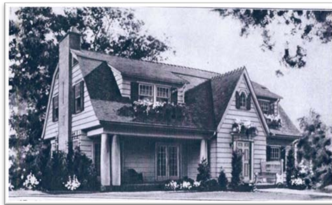
Example of a kit home, 1906 Pinecrest. The Glen Falls, #P3245, in Sears Catalog of Houses , 1926, page 42.